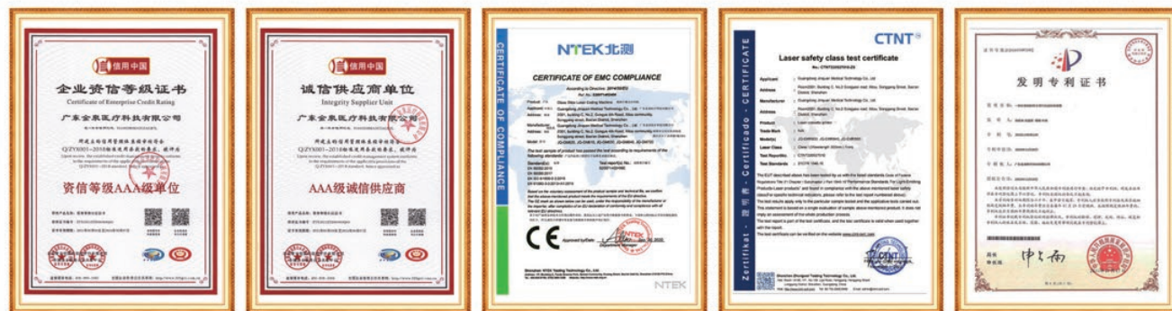
Enterprise Credit Rating Certificate