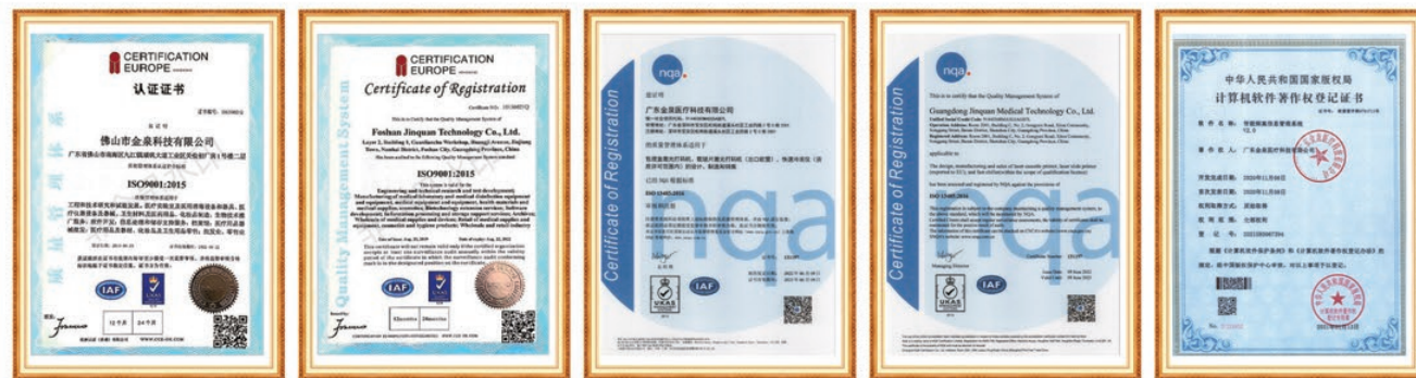
ISO9001 Quality Certificate